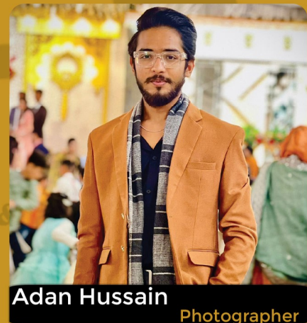
Adan Hussain Photographer